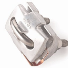
Bimetallic bow clamp