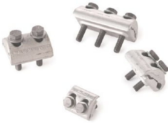
Parallel groove clamps