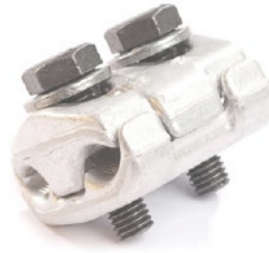
Bimetallic parallel groove clamps