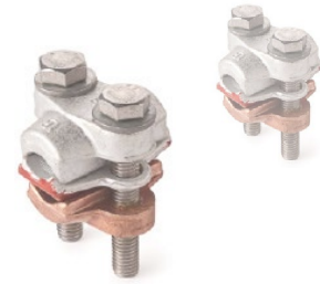
Bimetallic cover tap-off clamp