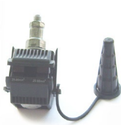
Insulation piercing connectors