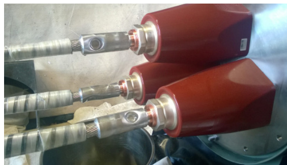
XLPE cable end