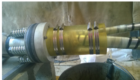
Oil cable end